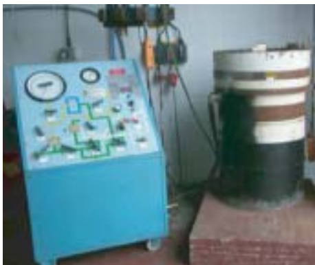
HP Test Equipment (max 4500psi)

Every sonar is supplied with a certificate confirming that it has satisfied the hydrostatic pressure test at its maximum operating depth.