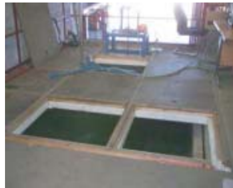
Tank (3m x 3m x 4m)

All our sonars are tested in our specially built tank. Measuring 4m x 3m x 3m deep it is lined with an acoustic baffling wall. This helps to measure sonar performance during development and test.